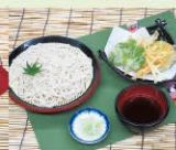
Vegetable Tempura Udon