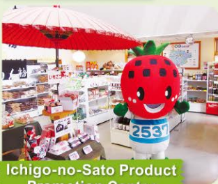
Ichigo-no-Sato Product Promotion Center

For sale are products made with Yoshimi Strawberries, such as strawberry Karinto and handmade strawberry jam. The seasonal strawberry Daifuku is an especially popular product that always sells out.