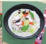
Vegetable Champion Udon