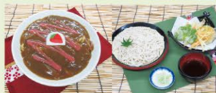
Strawberry Curry Udon