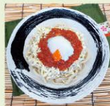
Meat Sauce Udon