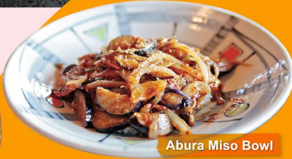
Abura Miso Bowl